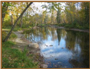
Turtle River in Three Island County Park

The County's Statement of Operational Commitments (LC-P2) provides the framework for balancing a range of public values in the forest and for accommodating change.